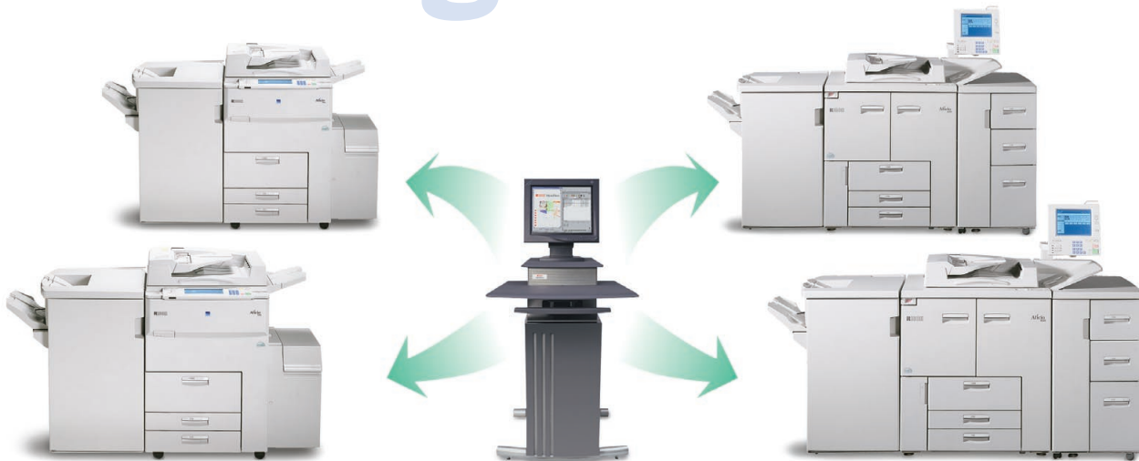
Ricoh MicroPress Supports Multiple Output Devices